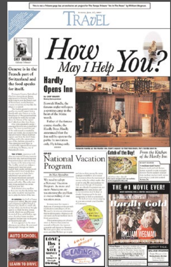
William Wegman, Art in the News , 1999