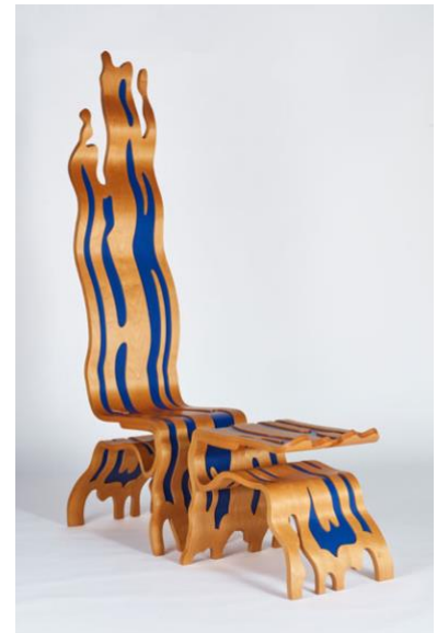
Roy Lichtenstein, Brushstroke Chair, Ottoman , 1986-1988