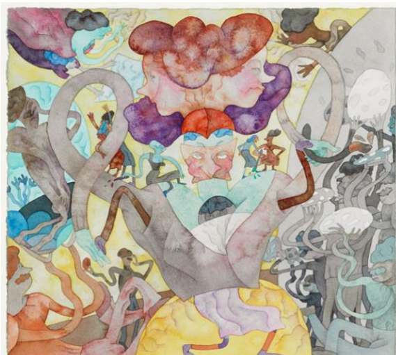
Gladys Nilsson, A Artystick Extravaganza , 1977

At the heart of museum work is the desire to both preserve and present our cultural heritage, but it can be a complex process to balance the needs of conservation, access, education, and museum resources. Like most museums, USFCAM shows only a portion of its more than 5,000 object collection at any one time. A variety of factors influence when and where objects are shown. With limited gallery space, CAM exhibits some collection works in public spaces on campus and with our corporate partners, but these venues pose environmental and security concerns.