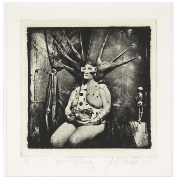
Joel Peter Witkin, Portrait of Nan , 1985

Admission to the Museum is free; however, a USF parking permit ($5.00 daily) or pay-per-space parking is required. Please visit our website cam.usf.edu for parking, directions, or more information on events associated with the exhibitions. Groups and organizations interested in tours should contact USFCAM to schedule at least two weeks in advance. Call (813) 974-4133 for additional information.