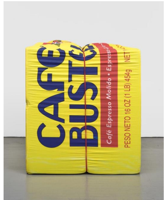
Lucía Hierro (b. 1987, New York, NY). 10oz. Café Bustelo , 2022. foam, digital print on cotton sateen, rubber band. 53 x 43 x 25 inches.

X Factor is curated by Christian Viveros-Fauné, CAM Curator at Large, and organized by USF Contemporary Art Museum, Tampa. X Factor is supported in part by the National Endowment for the Arts.